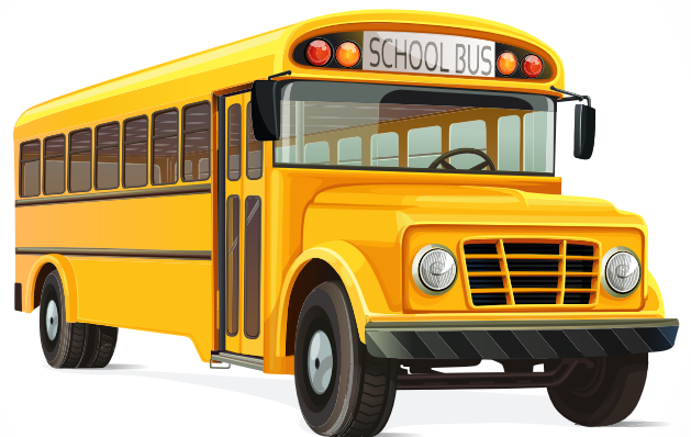
a yellow school bus