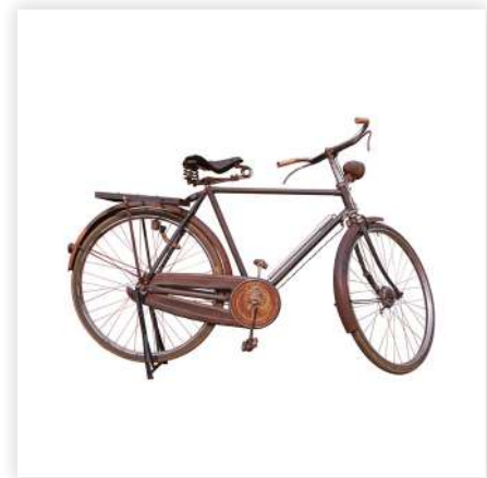
an old bike