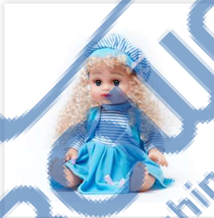
a beautiful doll