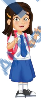
a school uniform