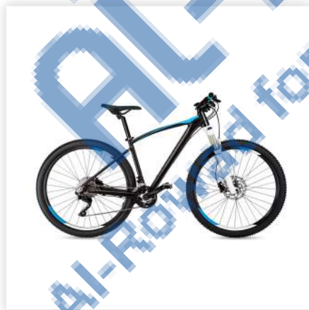
a new bike