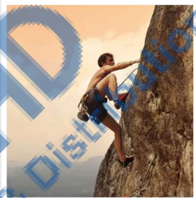
climb a mountain

Vacation: A period of rest from school, work, or other activities. Every summer we go on a vacation.