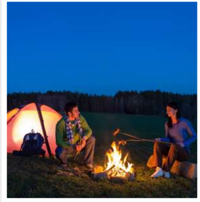
a camping trip