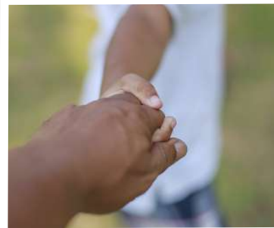
hold his hand

Slipped: To fall. The boy's leg slipped.