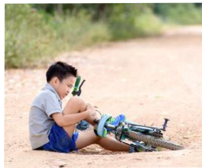
the boy slipped