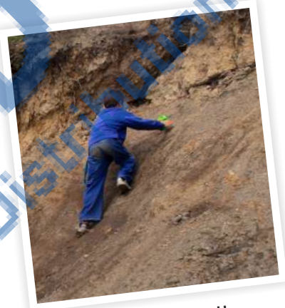
up the hill

Hold hands: To clasp hands together. My dad held my hand when I slipped down the hill.