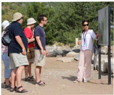
the guide is leading the group