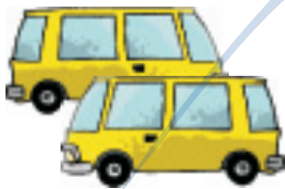
two bus es

To make nouns ending in s , ch , sh and x plural, we add es .