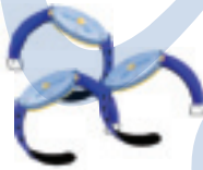
three watch es