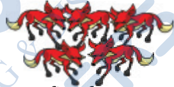
five fox es

When a noun ends in y , we have to take off the y and add ies .