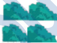
four bush es