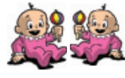
two bab ies

If the letter in front of the y is a vowel, we just add s .