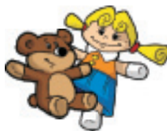
two toy s