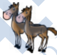
two pon ies