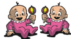
two bab ies

If the letter in front of the y is a vowel, we just add s .