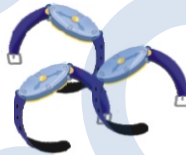
three watch es