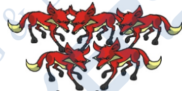
five fox es

When a noun ends in y , we have to take off the y and add ies .