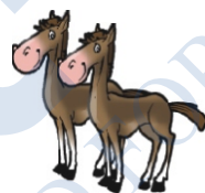
two pon ies