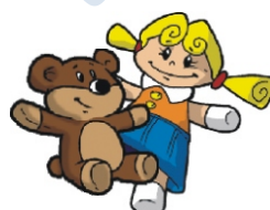
two toy s