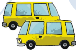
two bus es

To make nouns ending in s , ch , sh and x plural, we add es .