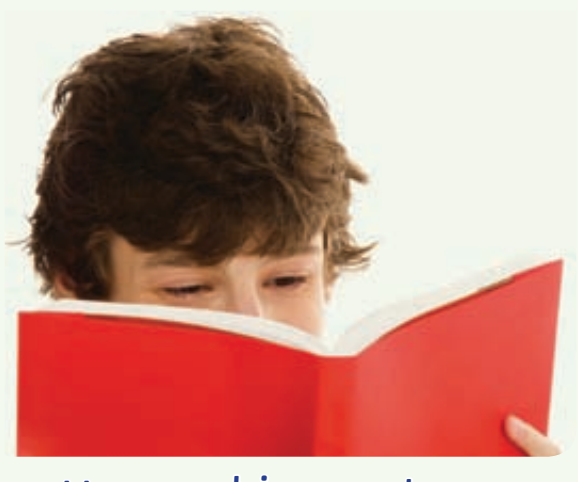
He uses his eyes to read a book.