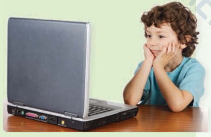
He uses his eyes to see the computer screen.