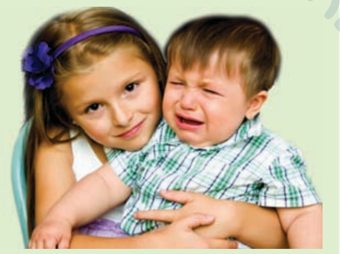
I can hear something loud.