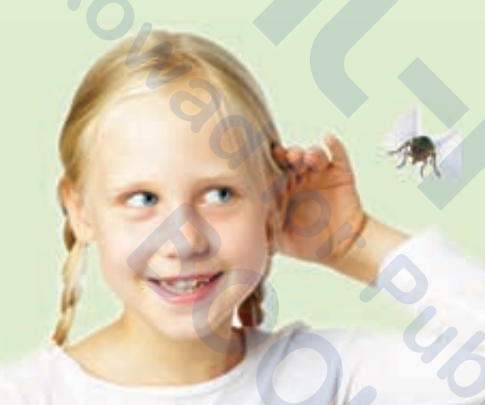
I can hear something soft.