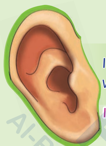
I hear sounds with my ears. I have two ears.