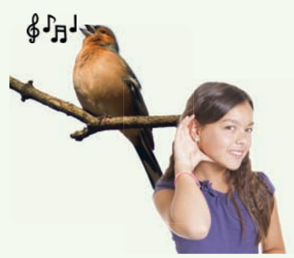
I can hear the bird singing.